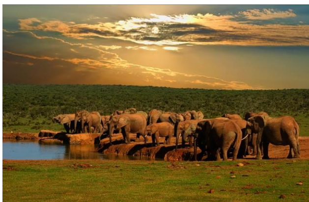
From the top: Clarence Drive, Southern Right Whale & Elephants in Addo Elephant Park