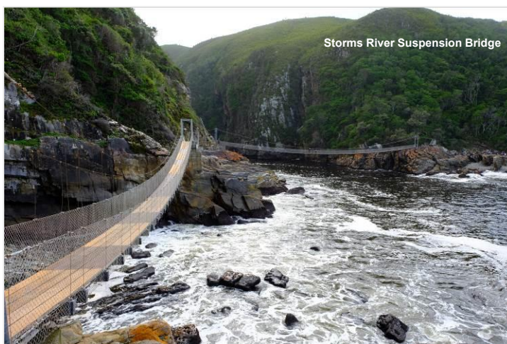
Storms River Suspension Bridge

After breakfast we will leave Addo Elephant Park and move along the coast making our way westwards to Storm's River in the Tsitsikamma region, a journey of approximate three hours with stops along the way. For two nights we will stay at Storms River Mouth Rest Camp, within Tsitsikamma National Park, which lies on the shores of the Indian Ocean. The park is known for its diverse ecosystems, including forests, fynbos and coastal habitats rich in marine life. Here we will stay in log cabins right on the shoreline. It is a rather spectacular